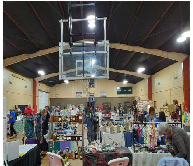
Vendors are busy setting up their booths.